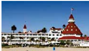
Photos: Top 10 grand hotels in the U.S.