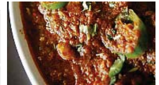
The Find: Red Chili Pakistani and Red Chili Express