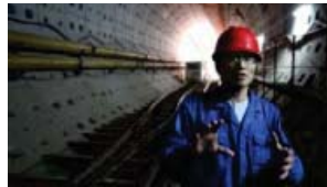
China moving heaven and Earth to bring Beijing water