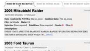
Vehicle complaint database